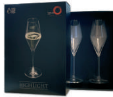
Standardkarton | standard box 2.0