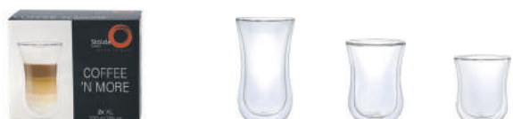
2er-Kartons | sets of 2 425 00 12 425 00 09 425 00 46