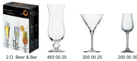
2.O Beer & Bar 483 00 25 205 00 25 205 00 30