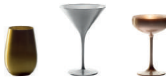
Becher Tumbler Cocktailschale Cocktail Glass Sektschale Champagne Saucer