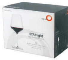
Standardkarton | standard box 6.0