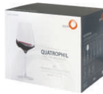
Standardkarton | standard box 6.0