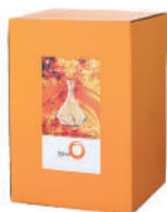
Standardkarton | standard box 1.F