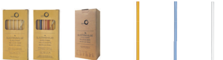
6er-Kartons | sets of 6 50er-Karton | set of 50 441 00 77 GH012 441 00 77 GH055 441 00 77