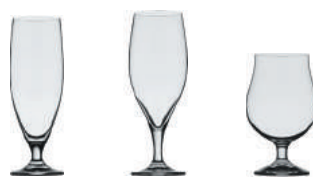
Imperial Iserlohn Berlin